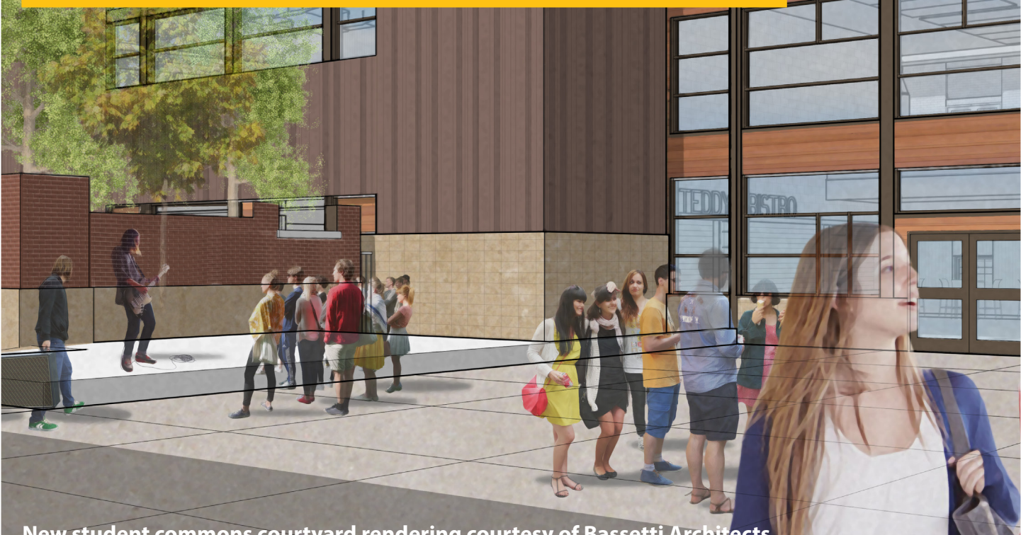
New student commons courtyard rendering courtesy of Bassetti Architects

A ceremonial groundbreaking for Roosevelt is scheduled for Saturday May 2nd . More details will be announced soon. Please check the project website: http://RooseveltBond.pps.net for the latest information and updates.